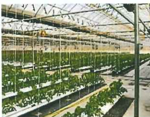
Nursery or Greenhouse (planting, potting, pruning, watering, harvesting, etc.)