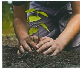
Forestry (soil preparation, planting, growing, cutting trees, etc.)