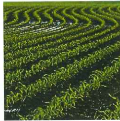
Agriculture or Field Work (planting, picking, sorting crops, soil preparation, irrigation, fumigation, etc.)