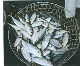
Fishing & Fish Processing (catching, sorting, packing, transporting fish, etc.)

If you answered "yes" to the questions above, please continue below. Otherwise, your form is complete.