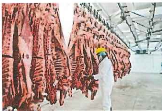
Processing & Packing (fruit, vegetables, chicken, eggs, pork, beef, lamb or other livestock, etc.)